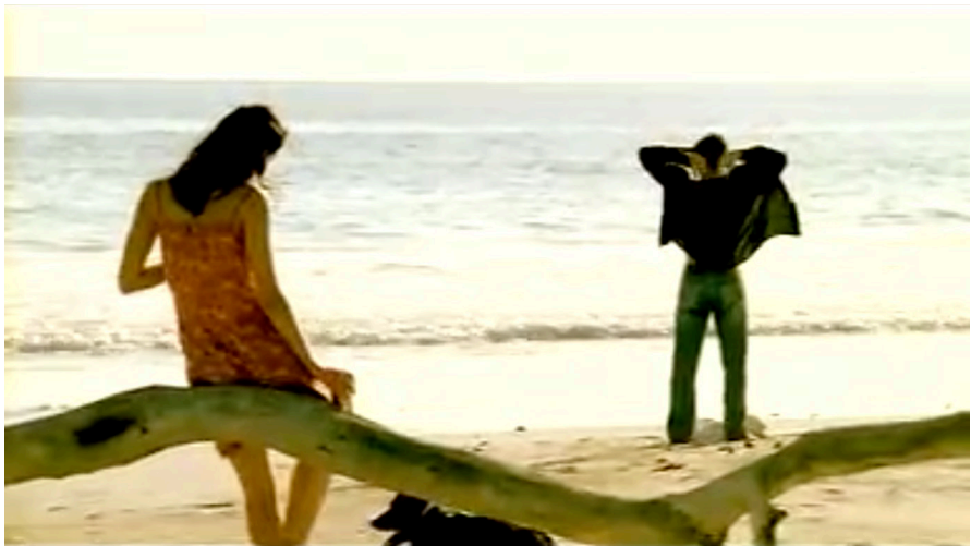
Fig. 3: Delighted observing women, HAVE A GREAT BREAK, film still (00:00:27).

The Pepsi commercial KUNG FU PEPSI CRUSH 8 (fig. 5–8) tells the story of a rite of passage in a Buddhist monastery where all the monks wear the same enigmatic sign on their foreheads, a sign that also adorns the entrance to the monastery. The child novice