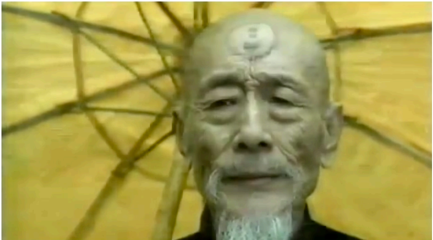
Fig. 7: The master, KUNG FU PEPSI CRUSH, film still (00:00:21).

them to remember the relevant product. Religious symbolism within the narration makes connections to well-known symbol systems and specific values. Furthermore, both commercials refer to conventionalised film forms: the HAVE A GREAT BREAK commercial refers to music videos and the KUNG FU PEPSI CRUSH commercial to martial arts films.