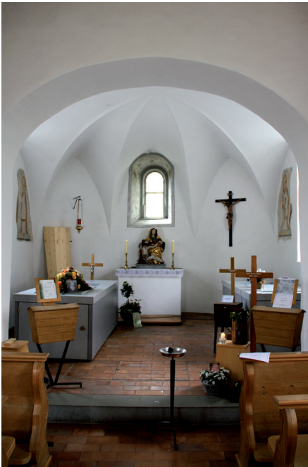
Fig. 1: A public laying out in the Roman Catholic ossuary chapel in Alpnach, Switzerland. The deceased are lying in catafalques (CH 2014) © Yves Müller.

the most important remaining material media, is the main code used to communicate gender differentiations, which are based on culturally shared ideas of gender (e.g. the male as plainer and somehow more earnest, the female as more playful and decorated).