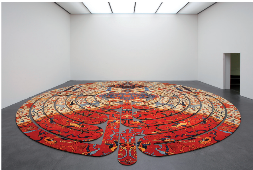
Fig.1: Su-Mei Tse, Proposition de détour , 2008, printed wool carpet, diameter 900 cm, here in a exhibition in the Museum of Art Lucerne, Switzerland in 2010 © Kunstmuseum Lucerne, photograph: Andri Stadler.

the industrial carpet is cut into. The quotation of the Chartres labyrinth is explicit and, accordingly, so is the reference to (medieval) Christianity. Labyrinths, found in Christian churches since the 4 th century, were associated with the image of the world as a place of sin and of purification as well as a path to salvation. 9 The Chartres labyrinth has been reproduced in many parts of the world. In this sense, Proposition de détour reiterates a Christian symbol within an already existing tradition of reproduction of this obligatory path. The design, in contrast, depicts an oriental paradise garden taken from a Persian carpet of the early 16 th century (Safavid Period, ca. 1520–1530). 10 The religious reference is to Islam. This work merges symbols from different religious traditions, a Christian labyrinth and an Islamic paradise, combining the oriental carpet tradition with the act of walking a labyrinth in a cathedral. A common thread that reinforces this unique link may be given by references to salvation ideas and concepts of life after death in both the labyrinth of Chartres and the textile representation of a Persian paradise. Through this playful connection, the references to the religious symbol systems in the work of art are materialised, on the one hand, on the level of representation and, on the other hand, on the level of performance: the original use of the labyrinth is in effect reiterated in the white cube atmosphere of the art mu-