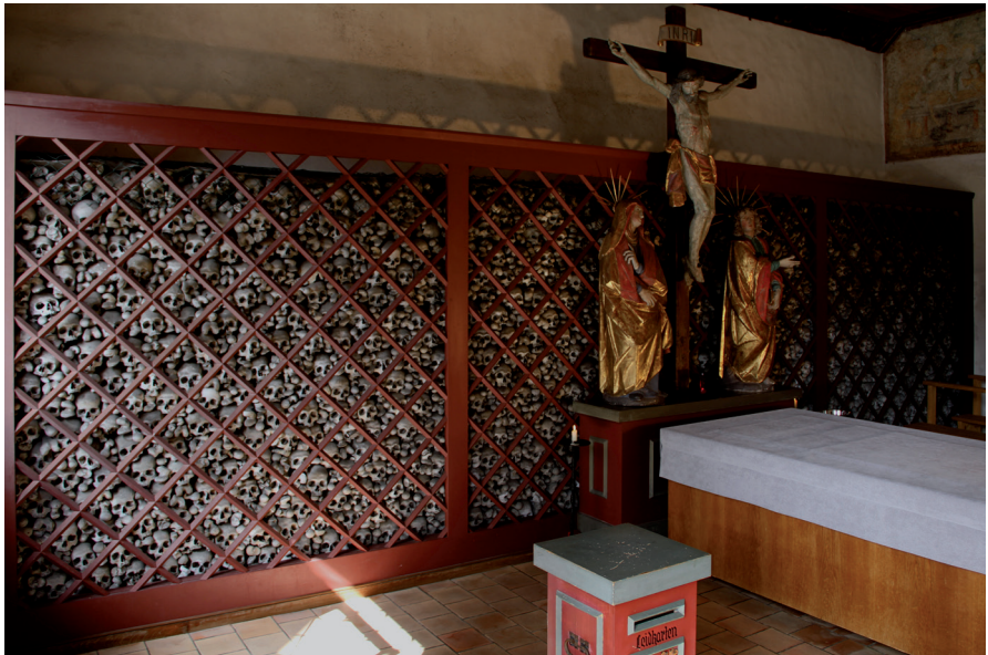
Fig. 4: The catafalque for the display of the dead bodies stands in front of the non-gendered collection of bones from past generations. Ossuary of Steinen (CH 2014)

and bones. While the freshly deceased person is gendered, the collective of the older mortal remains is exhibited in a non-gendered way, communicating the social equality (with regard to age, gender, social standing, wealth etc.) of the mortal remains. 15