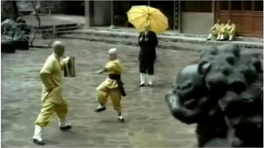
Fig. 6: Rehearsing Kung Fu, KUNG FU PEPSI CRUSH, film still (00:00:09).