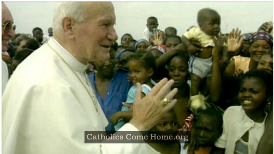
Fig. 10: Pope John Paul II visiting what is probably Africa, commercial CATHOLICS COME HOME 2009, film still (00:01:28).

the ancient, contemporary and global heritage of the organisation by referencing its charitable (fig. 11), educational and health programs.