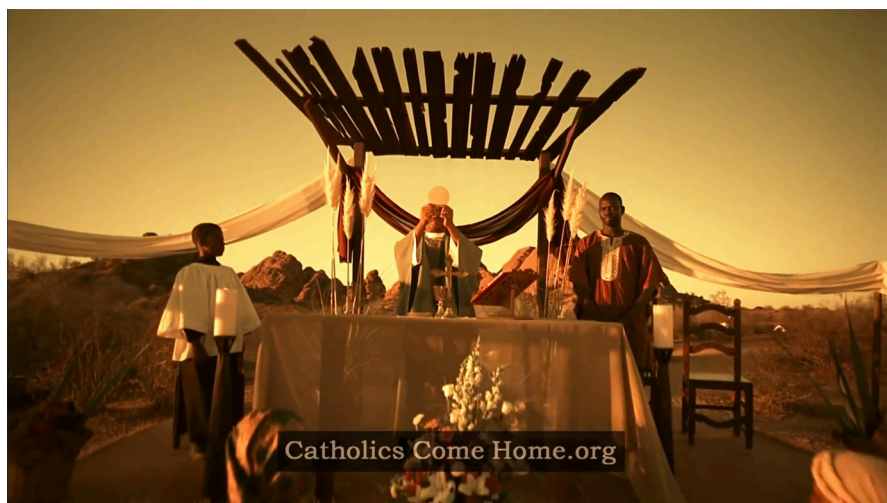
Fig. 9: A Catholic mass being performed likely somewhere in Africa, commercial CATHOLICS COME HOME 2009, film still (00:01:10).

The CATHOLICS COME HOME video is something different. Its purpose is to move North American Catholics to engage actively in church life. On a visual level the commercial shows a large number of typical Catholic references such as rituals (fig. 9), architecture (St. Peter's Basilica in Rome, for example), art (Michelangelo's fresco in the Sistine Chapel, for example) and a number of popes (fig. 10). The narration highlights