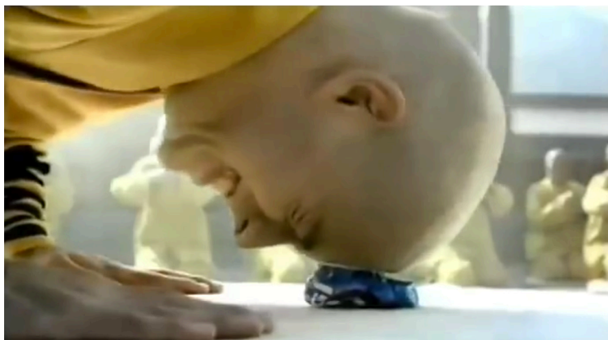
Fig. 8: Crushing Pepsi can with forehead, KUNG FU PEPSI CRUSH, film still (00:00:09).

The CATHOLICS COME HOME video is something different. Its purpose is to move North American Catholics to engage actively in church life. On a visual level the commercial shows a large number of typical Catholic references such as rituals (fig. 9), architecture (St. Peter's Basilica in Rome, for example), art (Michelangelo's fresco in the Sistine Chapel, for example) and a number of popes (fig. 10). The narration highlights