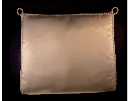
Fig. 3: Coffin pillows for women (left) and men (right) © Urnesa AG.

That the body is dressed and thereby gendered seems quite common for the Western 9 world, but it is surprising that this representation of gender is usual even if the body is not in view of the public, but put directly in an (afterwards closed) coffin and then buried or cremated. Nearly all burial dresses I found were gendered, with only a small minority unisex. Gender seems to be so important for this last presentation