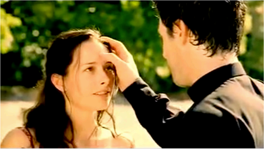
Fig. 4: Sign of a cross, HAVE A GREAT BREAK, film still (00:00:41).

is seen entering the monastery, preparing for life as a monk, at first failing and later, when older, passing tough tests in kung fu. As the final step in his education, he must crush a Pepsi can with his head, inscribing the mark of the pull tab on his forehead. Both commercials play with surprise effects, in which, with a twist in the narration, something unexpected happens. Humour is used to engage the audience and cause