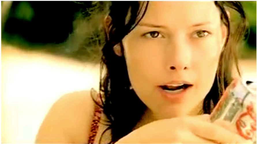
Fig. 2: Sexy women with Coke can, HAVE A GREAT BREAK, film still (00:00:20).