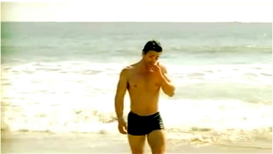
Fig. 1: Sexy priest, HAVE A GREAT BREAK, film still (00:00:09).

To that end the Coca-Cola commercial HAVE A GREAT BREAK 7 depicts a highly sexualised masculine figure (fig. 1) whom a young and equally erotic women (fig. 2) observes as he walks out of the water at a secluded, Caribbean-like beach. While opening and drinking from a can of Coke Light, the woman takes the man for an available sexual object (fig. 3). As he dresses and puts on a clerical collar, it becomes evident that he is a presumably celibate priest. The only body contact between the two actors consists of the priest’s placing of the sign of the cross (fig. 4) on the woman’s forehead using her drink as holy water or balm.