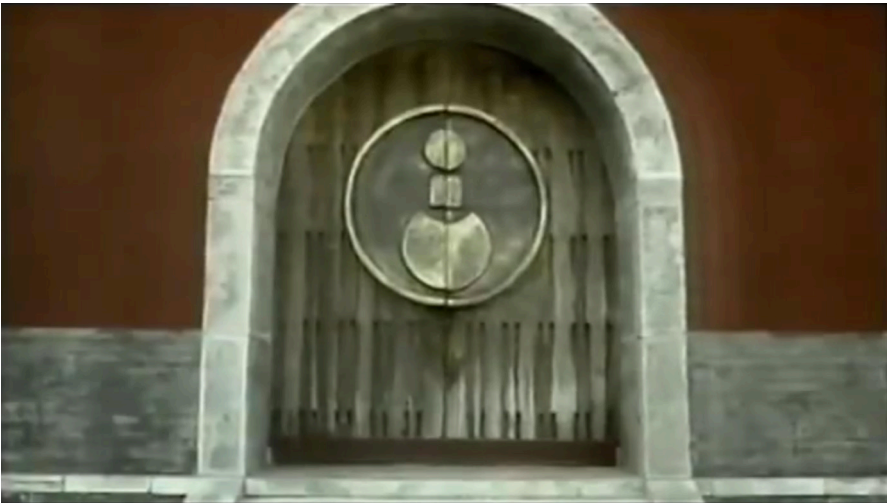
Fig. 5: The sign at the front door of the Buddhist monastery, KUNG FU PEPSI CRUSH, film still (00:00:09).

is seen entering the monastery, preparing for life as a monk, at first failing and later, when older, passing tough tests in kung fu. As the final step in his education, he must crush a Pepsi can with his head, inscribing the mark of the pull tab on his forehead. Both commercials play with surprise effects, in which, with a twist in the narration, something unexpected happens. Humour is used to engage the audience and cause