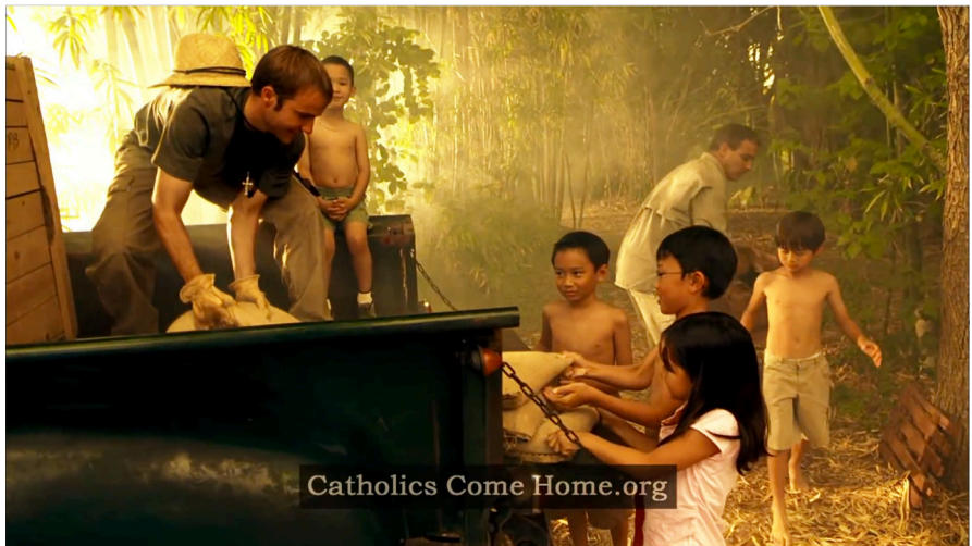
Fig. 11: Charity worker with a crucifix around his neck bringing goods to poor children, commercial CATHOLICS COME HOME 2009, film still (00:00:24).

the ancient, contemporary and global heritage of the organisation by referencing its charitable (fig. 11), educational and health programs.