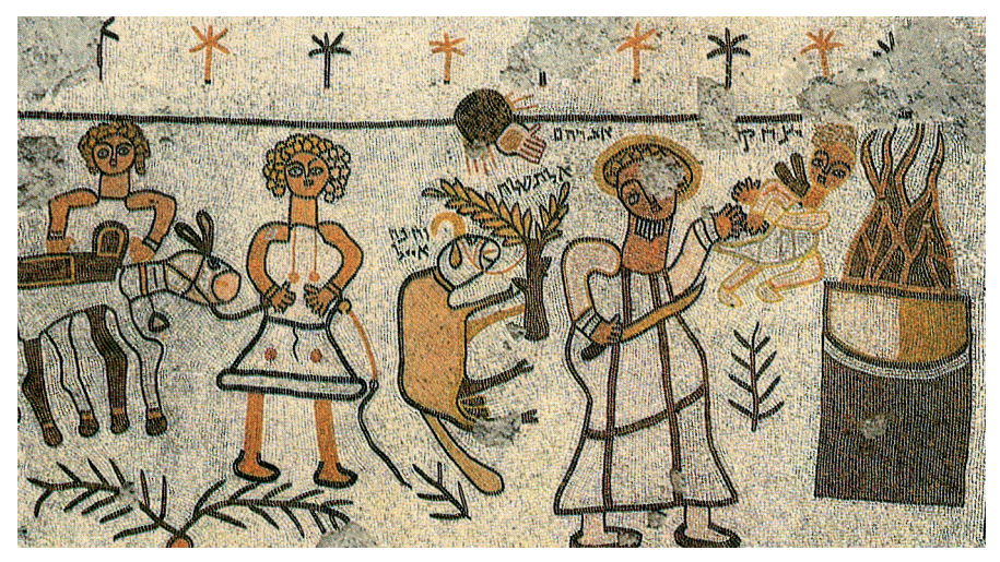
Fig. 2: Bet Alpha Synagogue – the hand of God prevents Abraham from sacrificing Isaac. Stähli 1988, 63.

widespread Jewish convention, persisting for hundreds of years, might be confirmed by the Beth Alpha synagogue mosaics (cf. fig. 2), located near Beit Shean in northern Israel, which date to the sixth century CE.<sup>23</sup> The existence of these Jewish pictorial images from disparate times and settings may dispel too narrow an interpretation of historical prohibition of visual images of God, for it appears that there has existed some scope within Judaism to depict divine action pictorially and anthropomorphically.