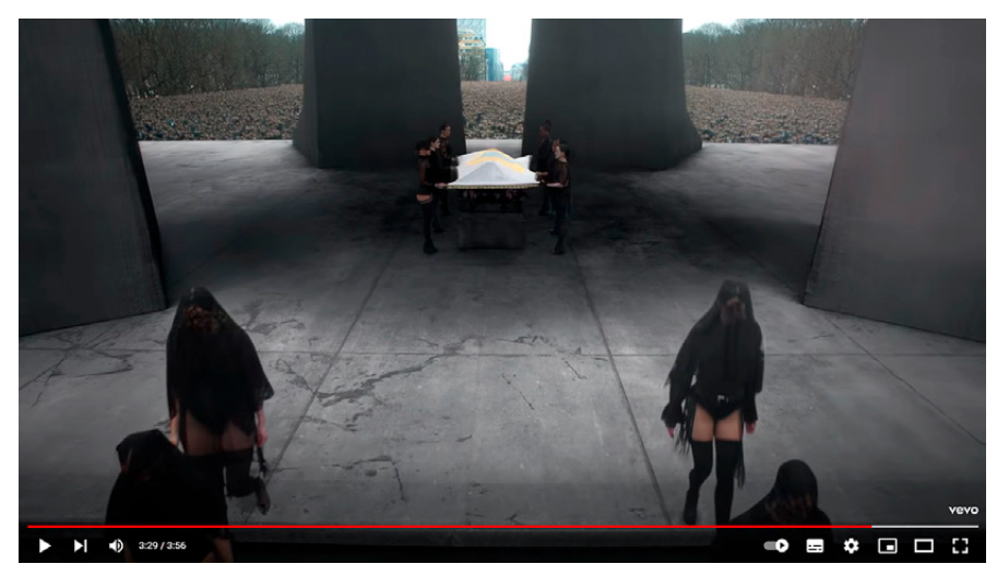
Fig. 4: The coffin is brought to the monument and covered with the national flag. Music video still, Stromae, FILS DE JOIE (Official Video, Mosaert/Spotify, BE 2022), 00:03:29.

pay last respects to the sex worker. The ceremony and the video close with military planes flying over the memorial.