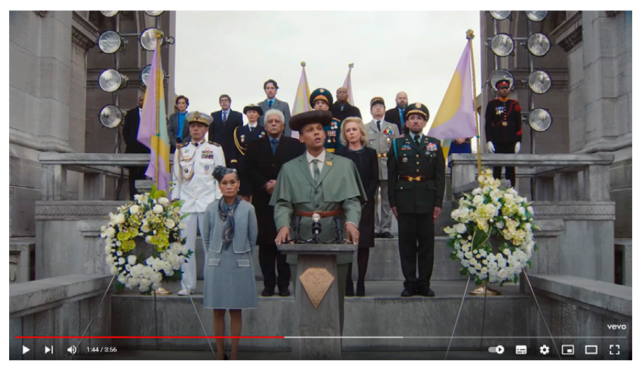
Fig. 1: Stromae, as the president, is holding a speech in front of other authorities. Music video still, Stromae, FILS DE JOIE (Official Video, Mosaert/Spotify, BE 2022), 00:01:44.

she deserves in a national tribute. At the same time, the scene of a pomp-filled funeral highlights the dangers of life as a sex worker. In just under four minutes, Stromae delivers a remarkable variety of imagery with "Fils de joie". At the center of the video is the sex worker's son, embodied by Stromae himself. He acts as the president of a fictitious state, delivering a eulogy to his mother. The ceremony contains numerous elements that are well-known to the viewer from great political or religious rituals. Important authorities from different countries are shown behind a grieving Stromae, different military troops perform an impressive choreography, and a column of black cars and motorcycles with mourning guests makes its way to the monumental location where the national tribute is to take place. And, of course, not to be missed from a ceremony of this kind: a grieving audience.