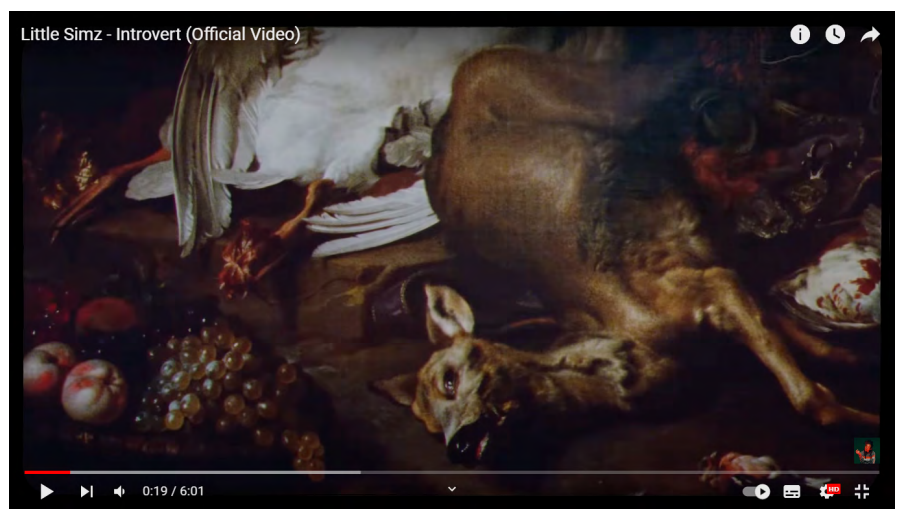
Fig. 4: Detail of a baroque still life with dead animals, film still, LITTLE SIMZ - INTROVERT (OFFICIAL VIDEO, Salomon Lighthelm, GB 2021), 00:00:19.

Also revealing is the inclusion of sections of historical paintings, from ca. 17th–19th centuries. They show scenes from ancient mythology and the Bible, some are still-life paintings with dead animals, colonial scenes or scenes from the Napoleonic Wars; overall they thematise sacrifice and death, war