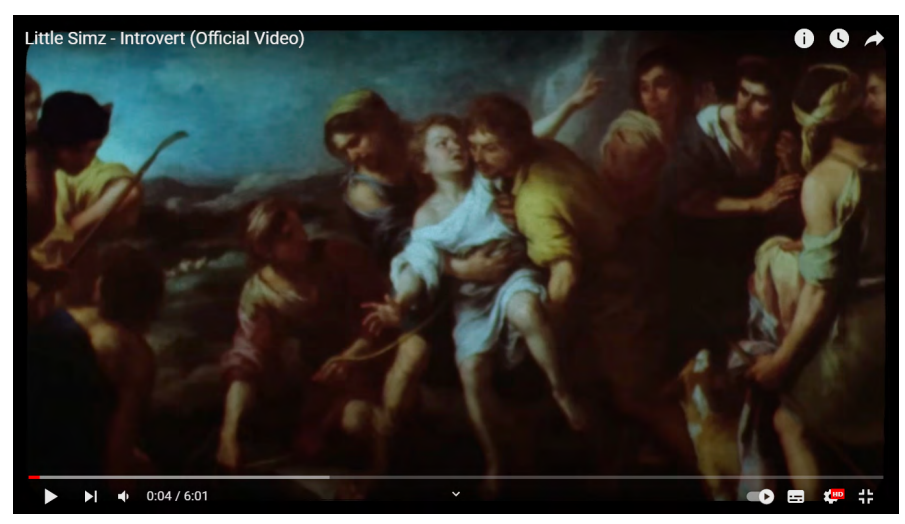
Fig. 3: Detail of the paining "Joseph and his brothers" by Bartolomé Esteban Murillo, film still, LITTLE SIMZ – INTROVERT (OFFICIAL VIDEO, Salomon Lighthelm, GB 2021), 00:00:04.