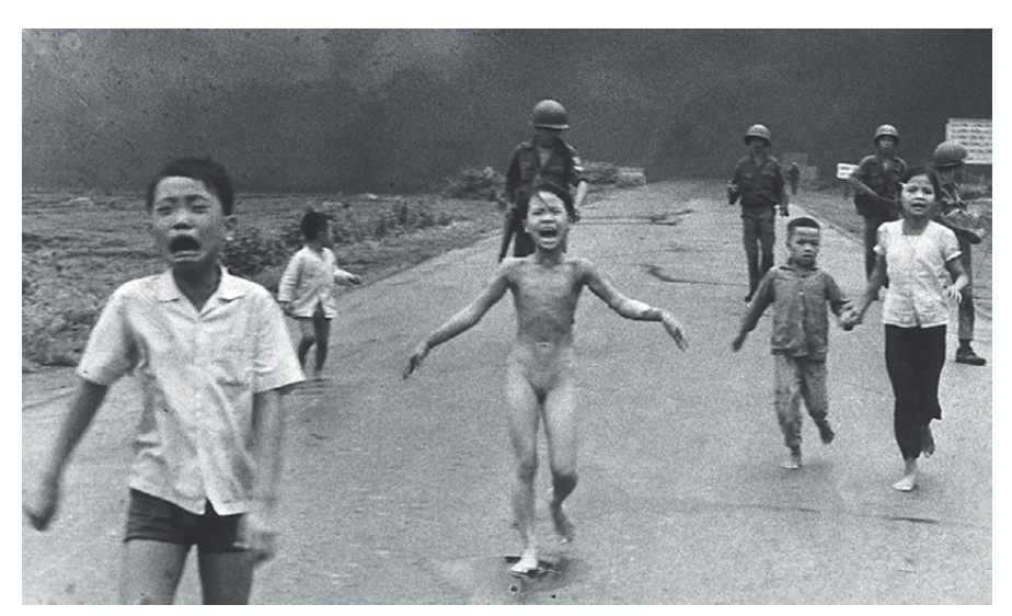
Fig. 3: Nick Út's Pulitzer Prize-winning photograph is said to have contributed significantly to the massive growth of opposition to the Vietnam War, https://is.gd/QpQ6B3 [accessed 4] anuary 2022].

That said, the effects of war photography as such are highly controversial. Does war photography merely serve to maximise economic profit or does it help raise the public's awareness of the horror of war and thus possibly even contribute to reducing the duration of wars? As an example of the second option, the German media ethicist Christina Schicha cites Nick Út's Pulitzer Prize-winning photograph of children fleeing from a napalm attack, which contributed significantly to the massive growth of opposition to the Vietnam War (fig. 3).<sup>14</sup> In both instances, however, the person depicted is instrumentalised to a certain degree and what is unique and individual is profanised through its depiction. Viewed from this angle, photography can be attributed a special form of violence, in that it appropriates human destinies and preserves them in unchangeable images.