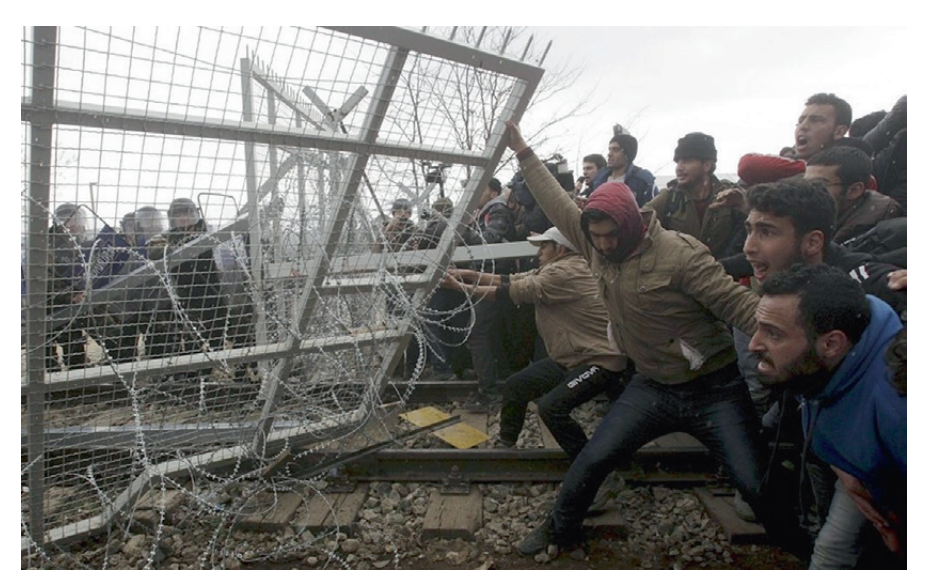
Fig. 2: Pictures of masses of people running against border fences have a de-subjectifying effect on the spectator, https://is.gd/imUBAh [accessed 4] anuary 2022].

catastrophes, of chaos, disorder, and violence, and these chains of associations are reinforced by typical verbal comments and headlines such as "migration wave" or "flood of refugees" or by metaphors such as "invasion" or "onslaught", borrowed from the context of war. Images and words thus construct migrants as a homogenous and threatening mass, so that it is completely clear to the recipient that the term "refugee crisis" refers exclusively to the excessive stress on their homeland provoked by the current refugee situation, and not to the crisis of people who have had to leave behind their belongings, their families, and their respective histories. This instance is but one example of the above-mentioned construction process.