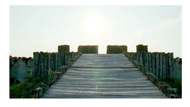
Figs. 4a-d: The Tree of Life is dotted with numerous means of physical ascent, suggesting spiritual progress and selftransformation (Terrence Malick, US 2011), 02:05:11; 00:41:13; 00:15:24; 02:04:55.